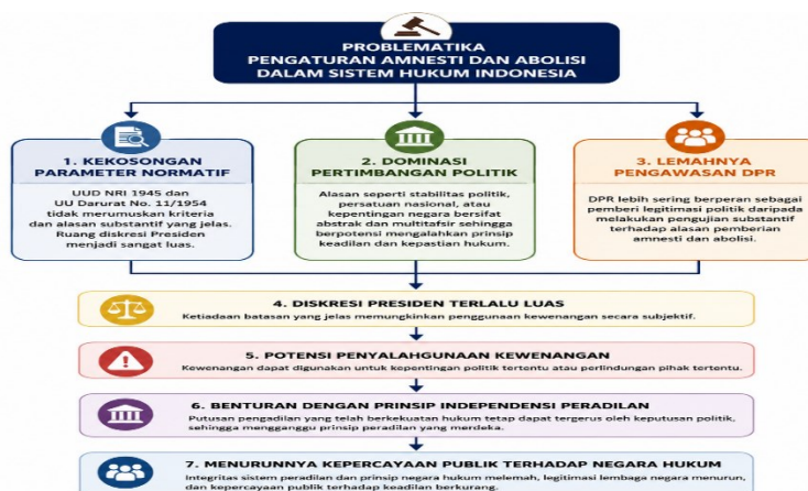
Figure 1. Hierarchy of Issues in the Regulation of Amnesty and Abolition in the Indonesian Legal System

Theoretically, every constitutional authority must be accompanied by clear limitation mechanisms to prevent it from becoming an instrument of power that is vulnerable to abuse. This principle aligns with the doctrine of constitutionalism, which positions the constitution as an instrument to limit state power. In this context, the President's authority to grant amnesty and abolishment cannot be understood as an absolute right, but rather as an authority that must be exercised in an accountable, proportional, and legally responsible manner. However, the current regulations actually show that there are still several fundamental weaknesses that have the potential to disrupt the principles of the rule of law.[14]