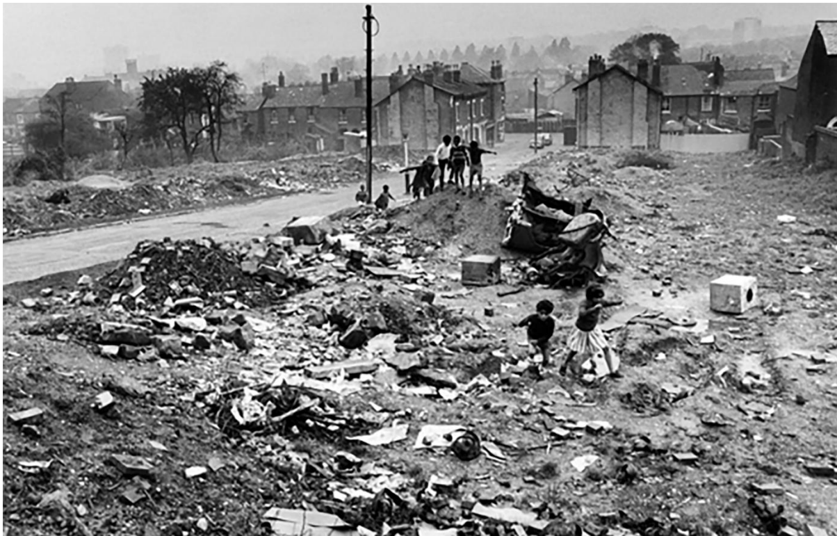
Figure 3: Demolition sites and transient living conditions during the slum clearing process in Balsall Heath district, Birmingham (November 1967)