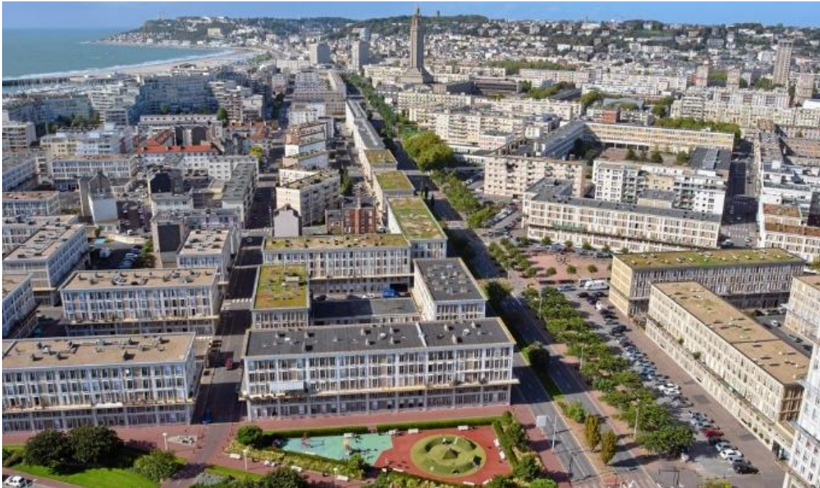
Figure 2: Post-war urban fabric of Le Havre following the reconstruction period (1950s).