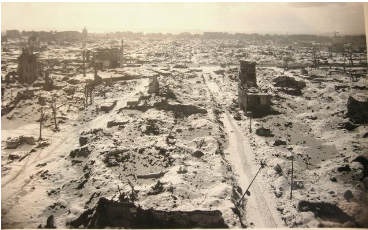
Figure 1: Le Havre city center after World War II, showing the extent of destruction (January 1945).